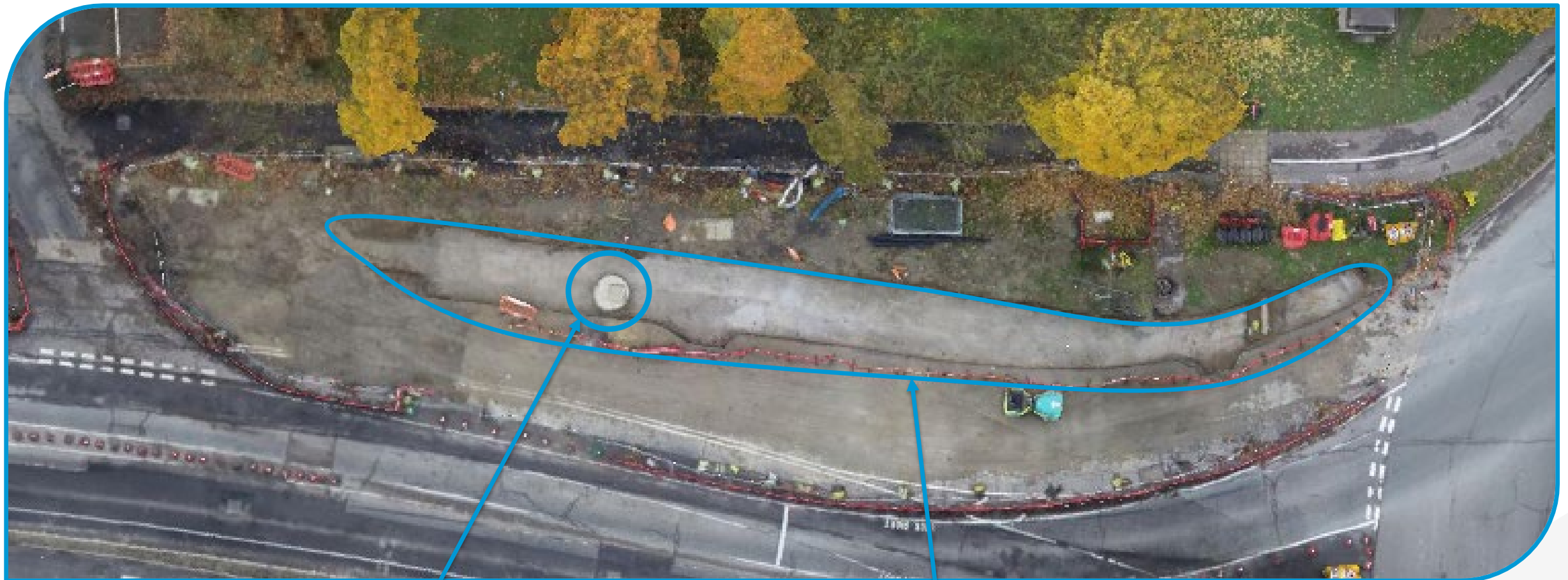
First Manhole installed on the southern side of the scheme opposite Peugeot.

With the traffic switch complete we have now commenced excavation to the southern side of the scheme. We have started at the western end of the scheme and completed the first manhole, road box excavation and placing of founding material to date. We have also encountered some services that have impacted progress. These are now resolved allowing the scheme to build momentum again.